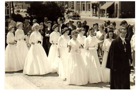
Above: Confirmation 1957

If there are enough interested students, St. Peter's will organize and run confirmation classes. In order that our future young members best understand the concepts, lessons would be offered in English.