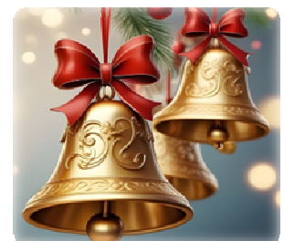
Paul Harvey's Christmas Story: The Man and the Birds, by Paul Harvey, ABC Radio Dec. 24, 2004.

At that moment the church bells began to ring. The sound reached his ears above the sounds of the wind. And he stood there listening to the bells - Adeste Fidelis - listening to the bells pealing the glad tidings of Christmas. And he sank to his knees in the snow.