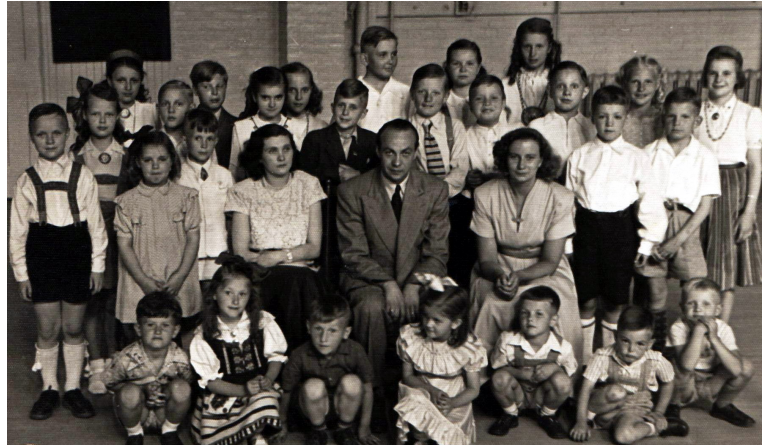
The first year of Sunday School—June 1949. Below: Sunday School outing to Jõekääru 1953.